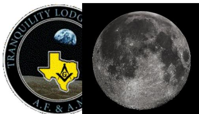
CHARTERED BY THE GRAND LODGE OF TEXAS, A.F. & A.M. Truth, Relief and Brotherly Love On an Interplanetary Scale