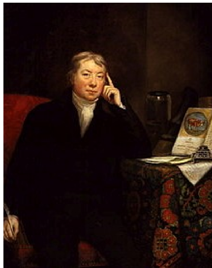
Edward Jenner by James Northcote

Born 17 May 1749, Berkeley, Gloucestershire Died 26 January 1823 (aged 73), Berkeley, Gloucestershire Residence Berkeley, Gloucestershire Nationality English Fields Medicine / Surgery, Natural history Alma mater St George's, University of London, University of St Andrews Academic advisors John Hunter Known for Smallpox vaccine; Vaccination